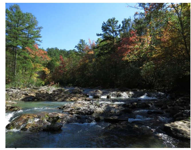
Beech Creek cataracts - LeFlore County

Education and Experience: Requirements at this level consist of a bachelor's degree in forestry from an accredited university. Other important attributes include good problem-solving skills, oral and written communication skills, ability to plan, computer skills, the ability to develop effective working relationships with a variety of people, ability to think independently and exercise good judgement.